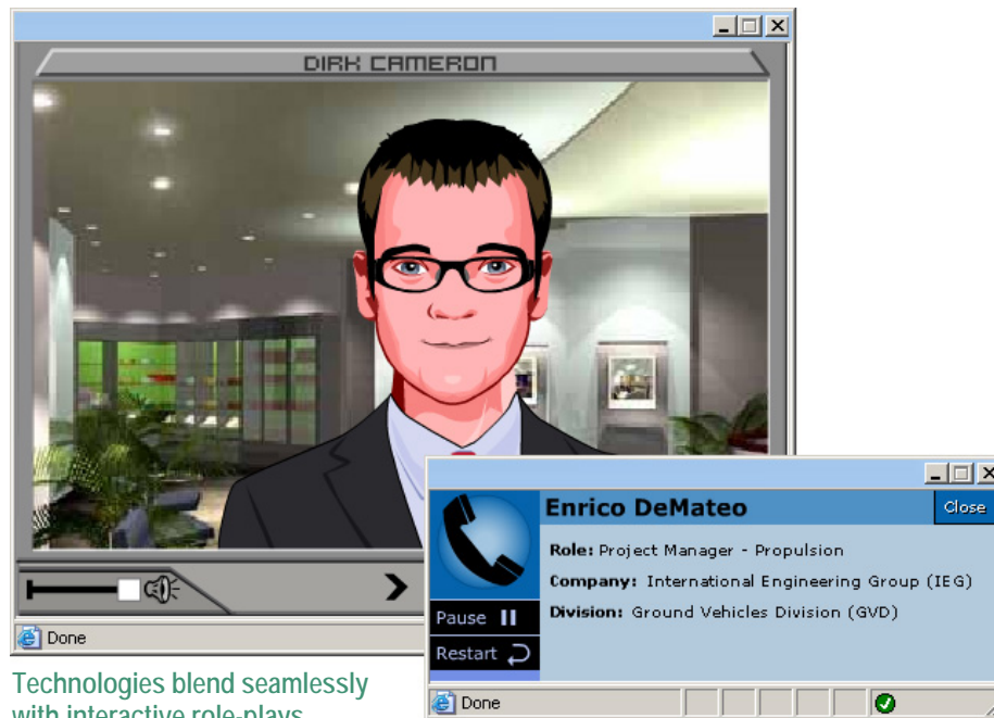
Technologies blend seamlessly with interactive role-plays.